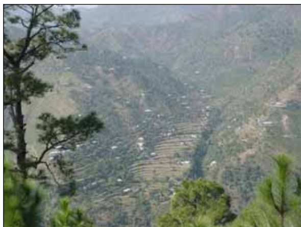
Although main hubs and towns in Pakistani-administered Kashmir are generally accessible year round by road, the steep mountain valleys of in the affected area are difficult to reach at the best of times. Access will be almost impossible, even by helicopter, in winter.

The International Organisation for Migration (IOM) and the International Federation of the Red Cross and Red Crescent Societies (IFRC), utilising logistical and operational support from UNJLC, launched a joint operation to drop small teams by helicopter into the remotest areas.