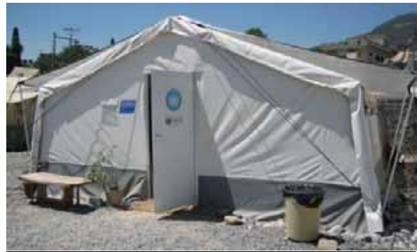
The UNJLC office in Muzaffarabad remains open in June.