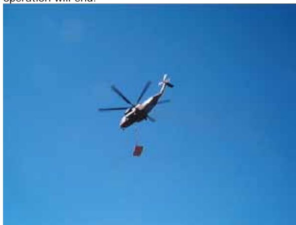
The UNHAS helicopter operation is currently due to end on May 31 st due to lack of funding.

Helicopter capacity has decreased again with the May 3 rd redeployment of the four DFID Mi-8s tasked by UNHAS , which brings the UNHAS fleet down to only 4 Mi-8s. The Merlin Mi-8 and ICRC Super Puma have also now ceased operations. ICRC will continue to operate one Mi-8 flying out of Muzaffarabad until May 10 th , at which point its air operation will end.