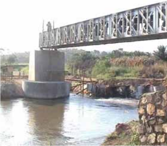
Nyemba Bridge under construction (June 2006)