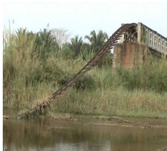
Nyemba Bridge (August 2004)

In December 1997, the Nyemba bridge located at 90 Km of Kalemie was swept away by severe flooding of the Lukuga river. The bridge used to link the city of Kalemie, on the edges of Lake Tanganyika to Kabalo- Kindu and Lubumbashi. The total budget of the project amounts to 2,500,000 Euros and the bridge should be completed by September 2006.